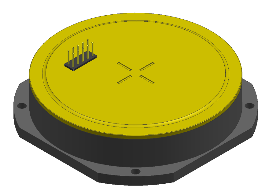
Fig 1 BS-FC91-240-A1EC