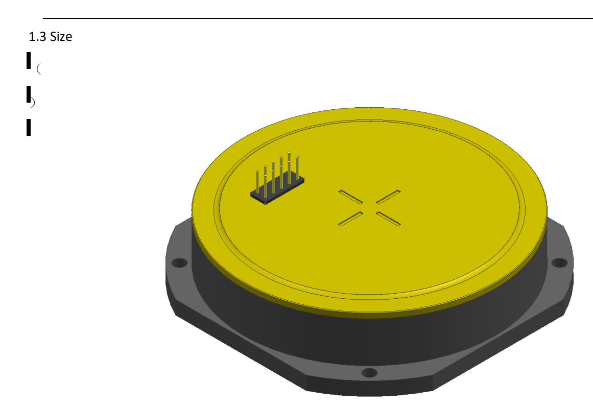
Fig 1 BS-FC91H-160-A1EC